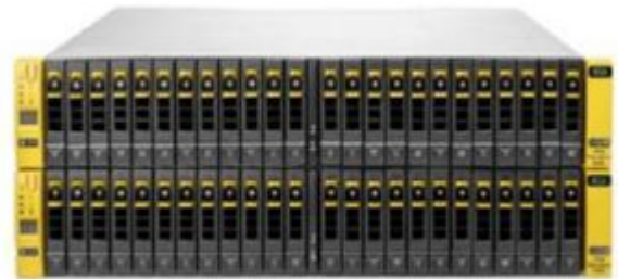
HPE 3PAR StoreServ 8000 Storage (4-Node Storage Base)