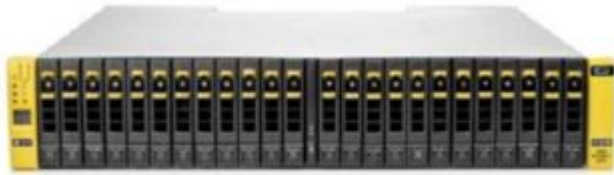
HPE 3PAR StoreServ 8000 Storage (2-Node Storage Base)

The HPE 3PAR StoreServ 8000 Storage offers flexible enterprise Tier 1 storage at a midrange price. HPE 3PAR StoreServ 8000 Storage delivers the performance advantages of a purpose-built, flash-optimized architecture without compromising resiliency, efficiency, or data mobility. The new HPE 3PAR Gen5 Thin Express ASIC provides silicon-based hardware acceleration of thin technologies, including inline deduplication, to reduce acquisition and operational costs by up to 75% without compromising performance. With unmatched versatility, performance, and density, HPE 3PAR StoreServ 8000 Storage gives you a range of options that support true convergence of block and file protocols, all-flash array performance, and the use of spinning media to further optimize costs. HPE 3PAR StoreServ 8000 Storage offers rich, Tier-1 data services, quad-node resiliency, seamless data mobility between systems, high availability through a complete set of persistent technologies, and simple and efficient data protection with a flat backup to HPE StoreOnce Backup appliances. Four models are available: 8200, 8400, 8440, and 8450. You can start small and grow without painful upgrades down the road. Enjoy the timeless 3PAR experience. Start small and seamlessly migrate to a new system or upgrade for greater scalability.